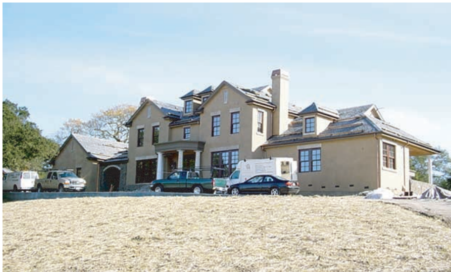
Total Concepts is currently building this custom home in Shiloh Estates with a building schedule of 14 months from start to finish.