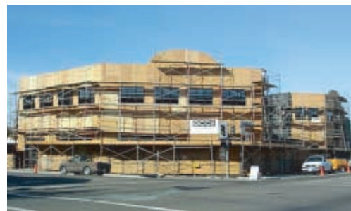
This 20,000 square foot commercial building at 401 Healdsburg Ave. in Healdsburg will be part of the already bustling downtown area. GCCI is the general contractor.